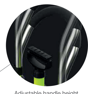
Adjustable handle height.